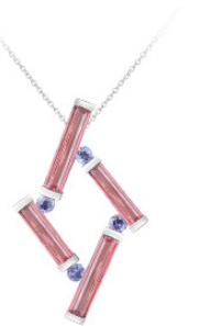
DENNY WONG DESIGNS