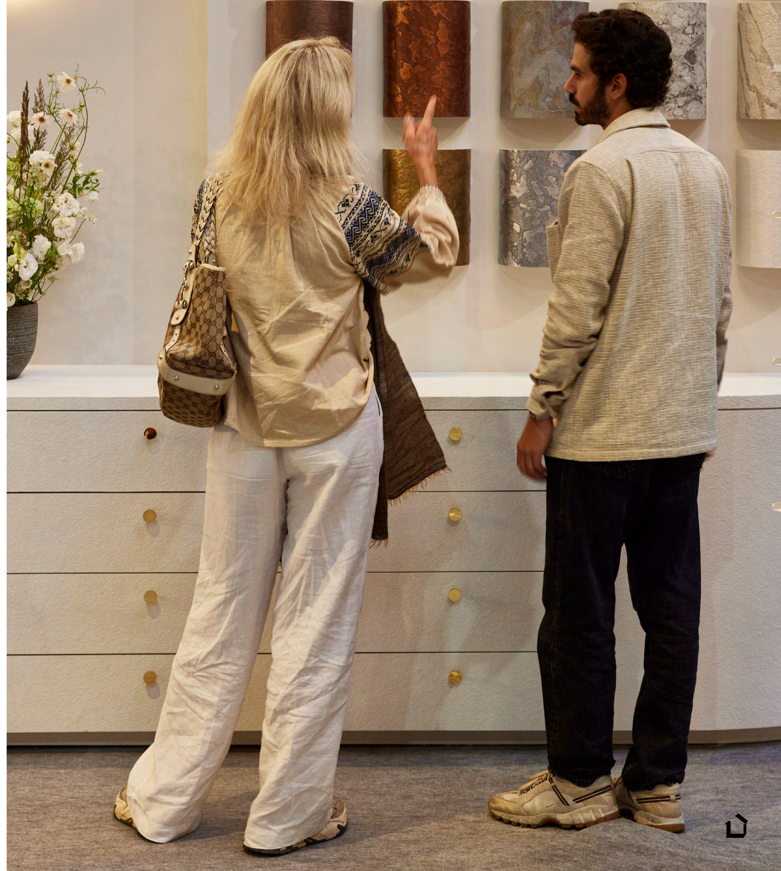
* On average for 2024 and 2025 shows