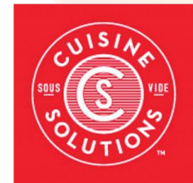
World Travel Catering Expo, Hamburg